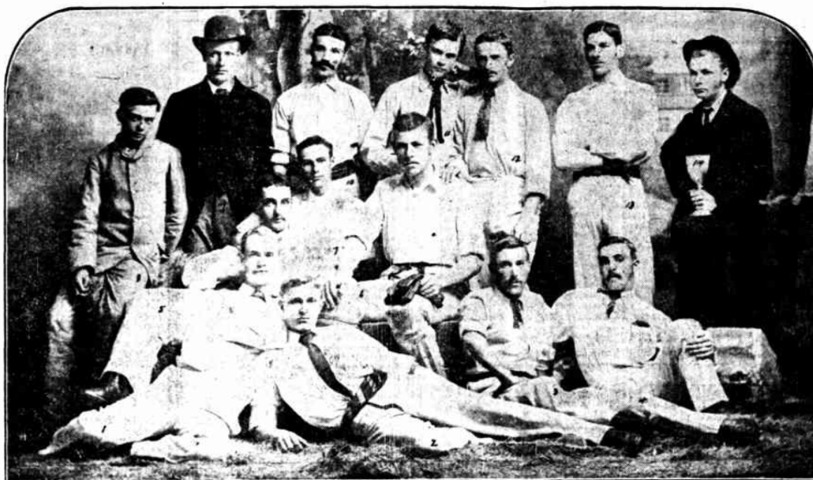
MEMBERS OF THE AUSTRAL CRICKET CLUB WHICH WON THE GOODFELLOW CHALLENGE CUP IN 1885-86

esteemed cricketers – none greater than perhaps Australian cricket’s greatest all rounder, George Giffen (who also played football for Norwood). See REDLEGS MUSEUM | PLAYERS .